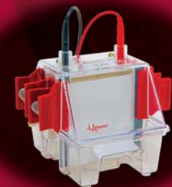
Mini Vertical Unit