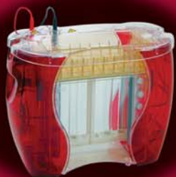
Deluxe Vertical Unit